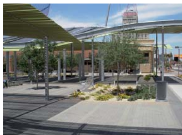
The 411 Building, Phoenix Civic Space. Preservation of historic structures and public spaces are important components of 21st Century Infrastructure.