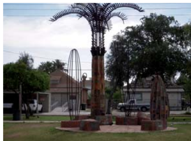
Roosevelt Park, Downtown Phoenix. A neighborhood park is a key element of the Neighborhood Component of 21st Century Infrastructure.