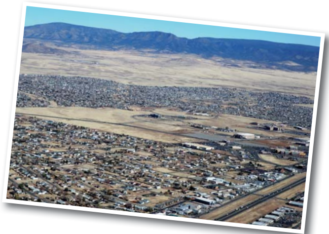
Prescott Valley, AZ

This year's conference will take place in beautiful downtown Prescott Valley. Prescott Valley is a growing, thriving community nestled between the Mingus and Bradshaw Mountain Ranges. This Town attracts people who seek the natural beauty of Arizona, a peaceful lifestyle and a blend of living and recreational amenities. Prescott Valley is truly one of the best places in the country to live, work and play! The Town of Prescott Valley is a recognized modern and vibrant regional urban destination in northern Arizona. It centers on providing medical services, transportation options, and educational and employment opportunities in the Quad-City region, and comprises a diverse cultural and ethnic base. Its small town character and a sense of community has been valued and retained as a part of its emergence as a regional leader. Community commerce has evolved to a mix of densities, intensities, and uses. Established business areas have flourished while new business and employment gateways are being developed.