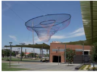
"Her Secret is Patience" by Janet Echelman, Phoenix Civic Space. Public art is an essential component of 21st Century Infrastructure.